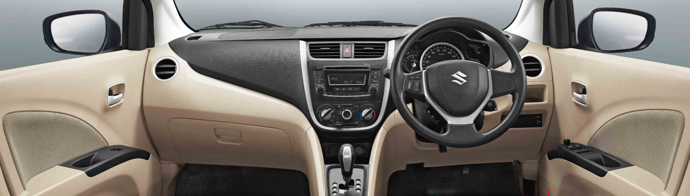
Exciting Dual Tone Interiors