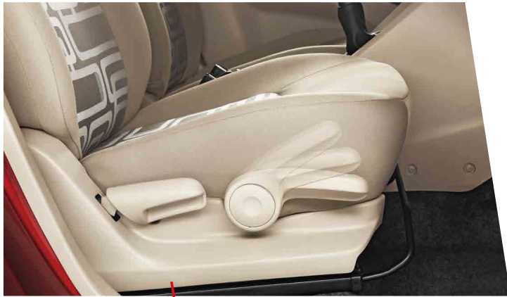
Seat Height Adjuster