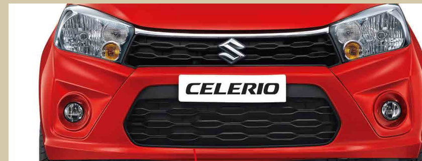
Stylish Front Grille & Bumper Design