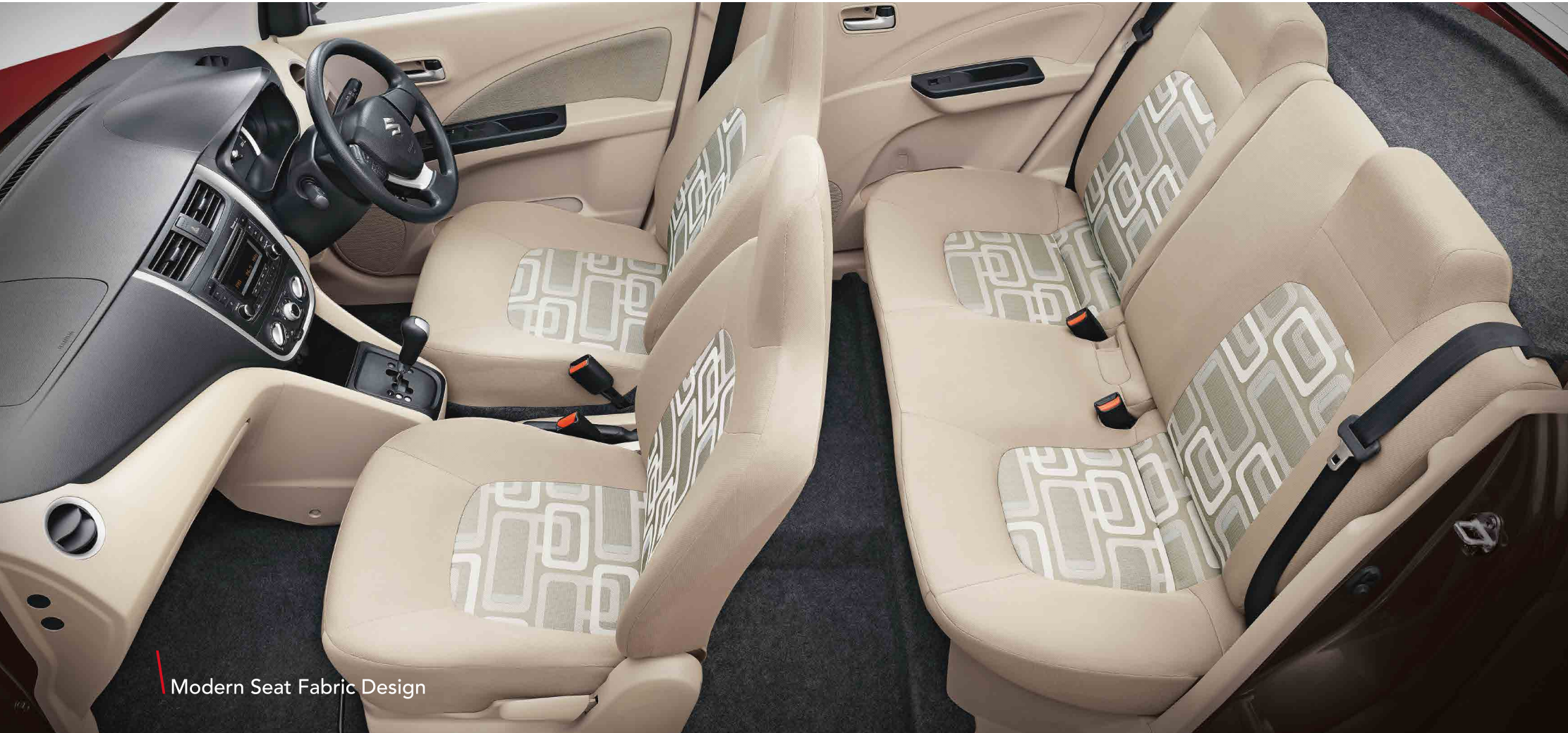
Modern Seat Fabric Design

Be at complete ease as you discover a world of space in the new Celerio. Beyond its generous cabin space, there is Seat Height Adjuster, Electronic ORVMs and a host of other features that take care of your comfortable driving experience.