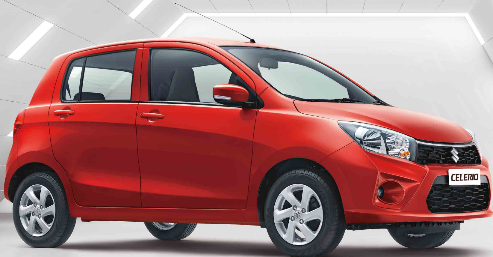
Stylish Alloy Wheels