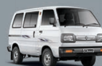
OMNI E 8 SEATER