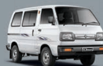
OMNI 5 SEATER